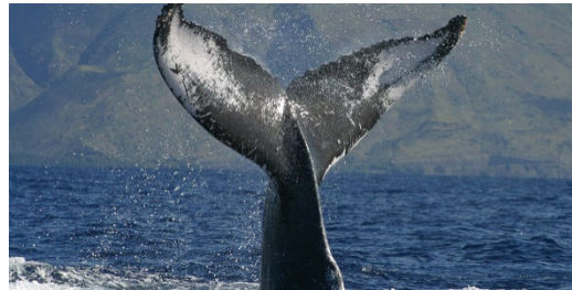
Hawaiian Humpback Whale Sanctuary

Due to limited capacity to integrate climate messaging into sanctuaries outreach, CPO will increase collaboration between its Communication, Education, & Engagement Division and the National Ocean Service/ONMS. This will help provide a capability to communicate the important role of climate in sanctuaries management for improved public awareness and understanding.