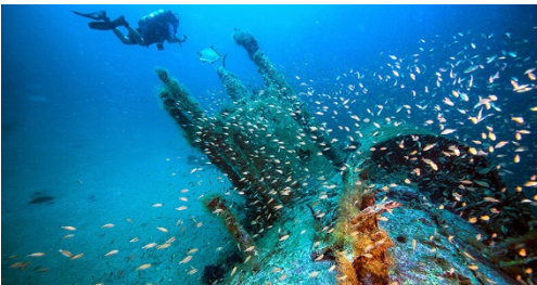
Monitor National Marine Sanctuary

CPO will co-support a Visiting Climate Scientist with OMNS for greater sanctuaries engagement on climate, to provide additional support for other activities in this proposal, and to help continue developing the ONMS-CPO relationship. The Visiting Scientist will help extend CPO’s efforts and provide a critical backbone for climate across sanctuaries.