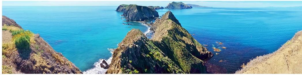
Channel Islands National Marine Sanctuary

CPO will focus a research investment to better understand, monitor, and simulate integrated and cascading climate effects on sanctuaries. This activity will primarily center around the identification of climate science and information needs of national marine sanctuaries and the ways that these intersect with the capacity, products, and expertise of NOAA Research (OAR) labs and programs.