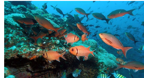
Flower Garden Banks National Marine Sanctuary

CPO will provide support for the National Marine Ecosystems Status platform and connect it with the National Climate Assessment (NCA) to provide an outlet for sanctuaries climate monitoring and data products. This will be a foundational component of an Oceans Report Card and provide marine ecosystem and socioeconomic indicators for the NCA.