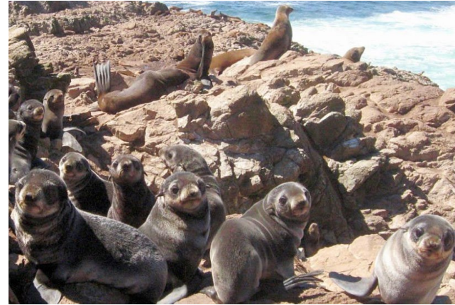
Greater Farallones National Marine Sanctuary

Climate change is currently addressed in a heterogeneous manner across the NMS System. Some sanctuaries have climate change deeply integrated into their activities and Management Plans, and some are not yet significantly focused on climate change.